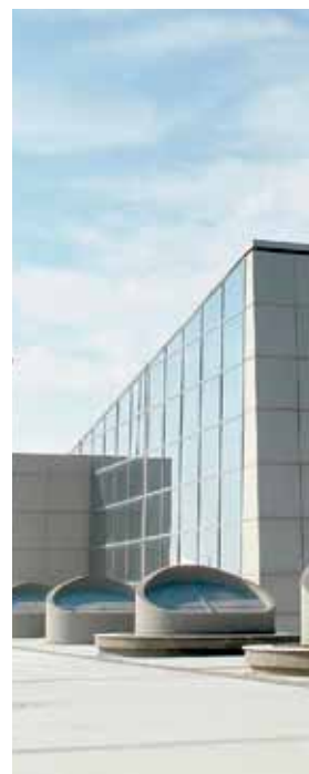
Thessaloniki Concert Hall