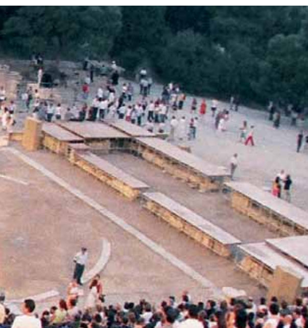
Ancient Theatre of Epidaurus