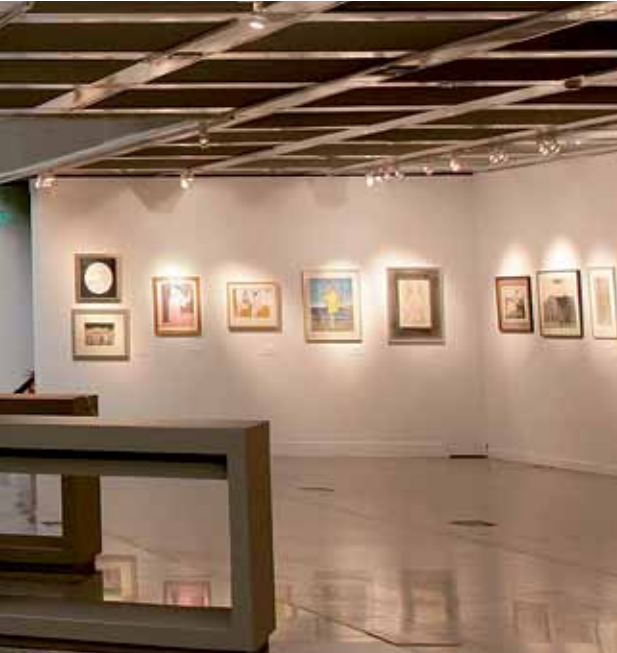
Teloglion Foundation of Art, A.U.Th

In 2021, Elefsina , a suburban city in Attica, will be the European Capital of Culture. It is the fourth Greek city to host this mega-event, following Athens (1985) Thessaloniki (1997) and Patras (2006). Thessaloniki International Fair takes place annually in September and it is a leading exhibition event in Greece and in Southeastern Europe. The Athens Authentic Marathon attracts thousands of runners from all over the world. The Athens and Epidaurus festival is Greece's foremost cultural festival and one of the oldest and celebrated performing arts festivals in Europe. From an art exhibition to a trade show, from a concert to a festival, from a small-scale event to a big international event, Greece can be the right host for any occasion. Well-trained, warm and hospitable people will work for the success of your event, always with a smile on their face.