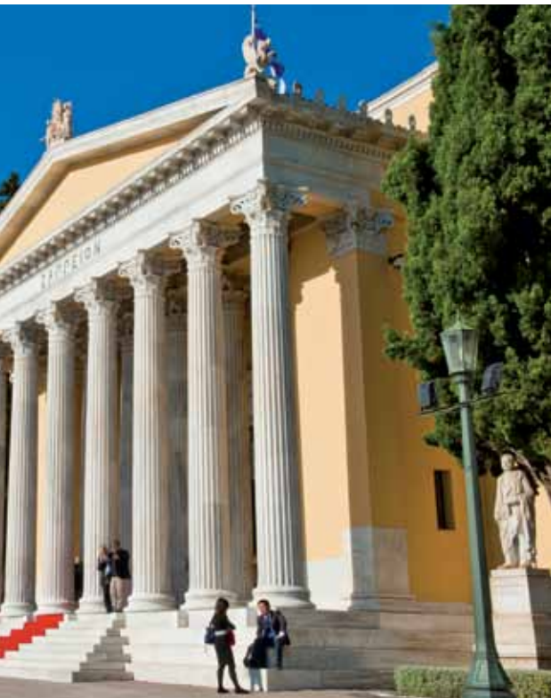
Athens, Zappeion Conference & Exhibition Centre

You will find that Greece makes the ideal choice for any MICE demand.