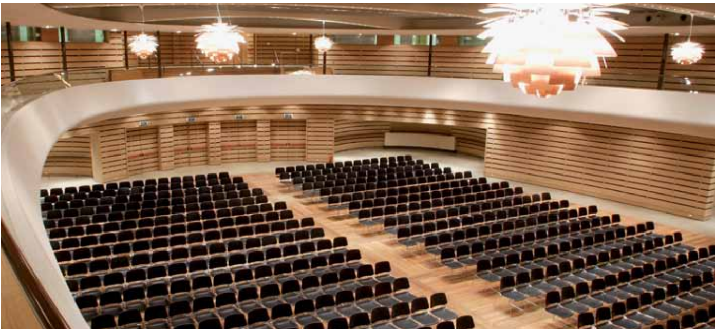
Megaron Athens International Conference Centre