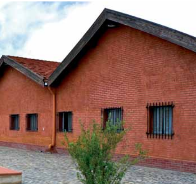
Exhibition facilities (old port warehouses)

Every September, the Thessaloniki International Exhibition Centre becomes the ideal world stage to do business. Its facilities are used to stage a variety of events - from regional shows aimed at consumers to major trade shows for entire industries and an international audience. Throughout the year, major fairs showcase the best and the newest products and services of premier industries, such as Renewable Energy Sources, Construction Technology, Tourism, Food, Beverages, Nanotechnology and many more.