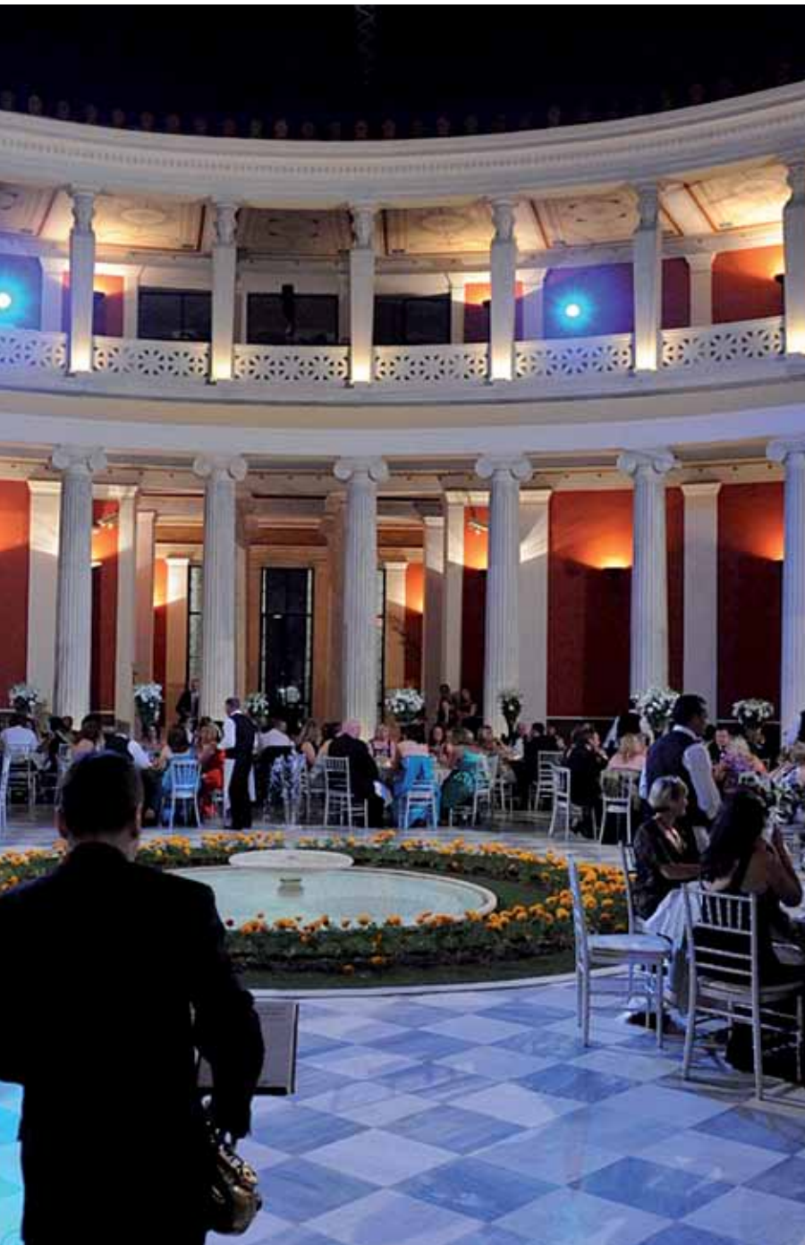
Zappeion Conference & Exhibition Centre

Numerous scientific conferences in medicine, architecture, natural sciences, humanities etc take place annually in Greece, reflecting the significance placed on innovative science while giving participants the opportunity to visit the cradle of science in the western world. Throughout the year, a large number of conference centres provide excellent infrastructure offering top-rated services in several key destinations such as Athens, Thessaloniki, Crete, Rhodes, Corfu, and in smaller ones such