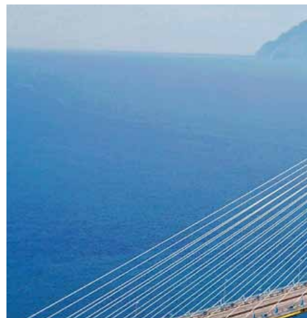
Rio - Antirrio Bridge