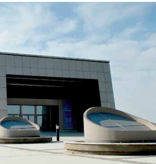
Noesis, Thessaloniki Science Centre & Technology Museum