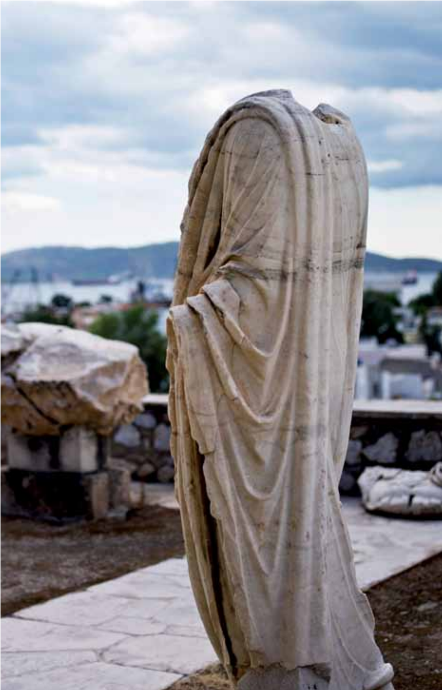
Elefsina Archaeological Site