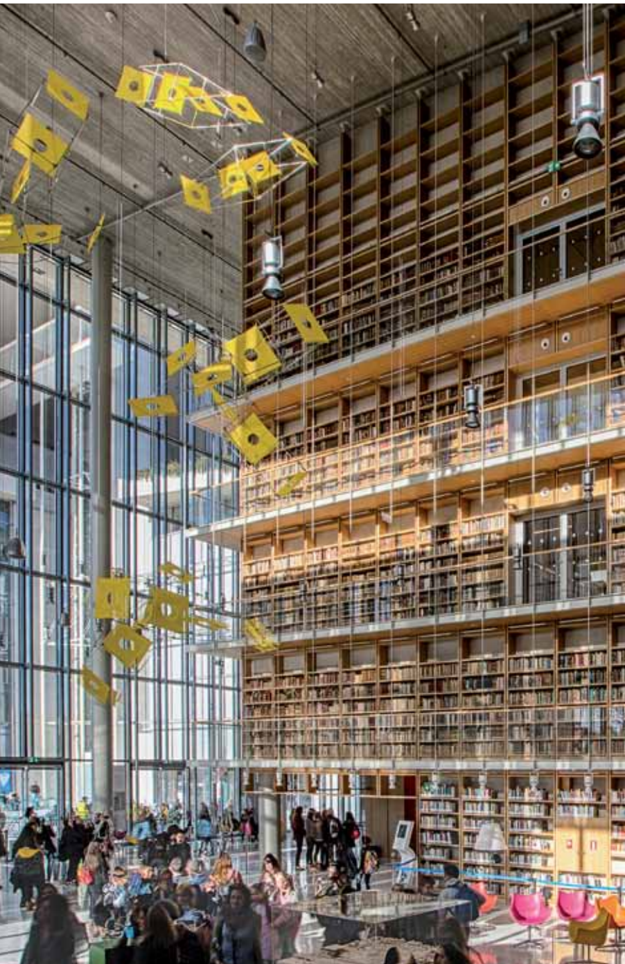
Stavros Niarchos Foundation Cultural Centre

While Greece is traditionally perceived as a holiday destination, there is much to endear the country to businesses and organisations wishing to arrange meetings, conferences, exhibitions and events. Greece is a longtime favourite choice of the meeting industry, not to say the appropriate setting for any occasion, thanks to its excellent climate conditions and great natural beauty; its historic and cultural legacy, evident across the country; the world famous Greek hospitality and the high