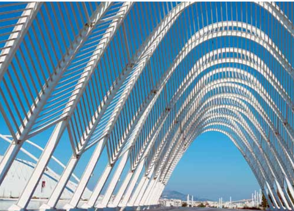
Olympic Athletic Centre of Athens 'Spiros Louis' (O.A.K.A.)

Greece lies where the continents of Europe, Africa and Asia converge. The country's location in the eastern Mediterranean region has contributed to establishing it as the ideal destination for conventions, meetings, events and international exhibitions. With a solid history that goes back over 4,000 years,