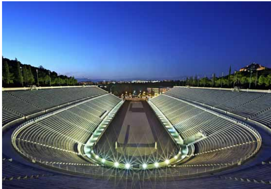
Panathenaic (Kallimarmaro) Stadium