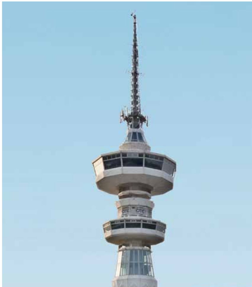
Thessaloniki International Exhibition & Congress Centre