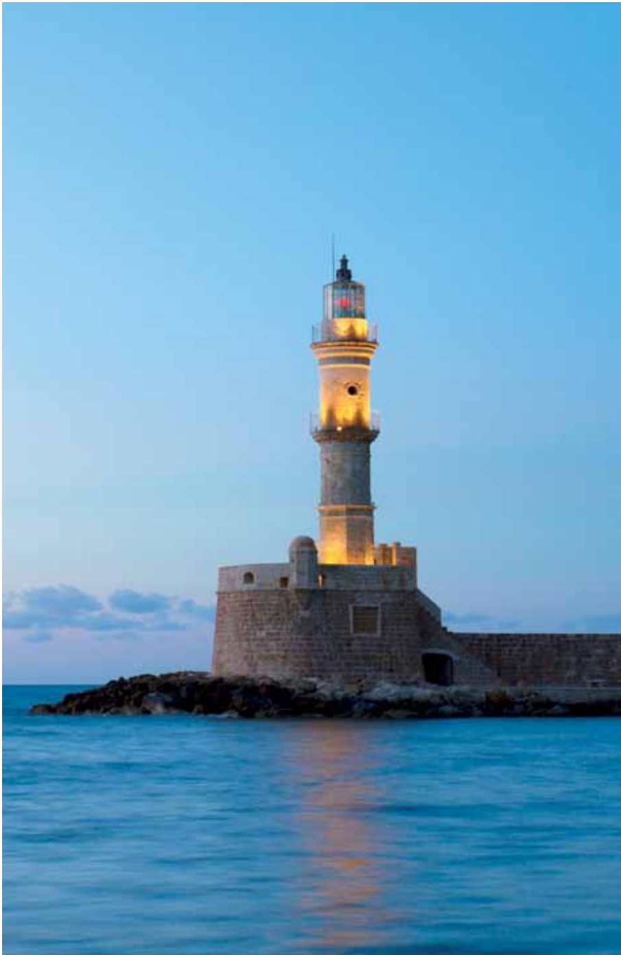
Chania lighthouse, the town's historic landmark at the old port entrance, Crete