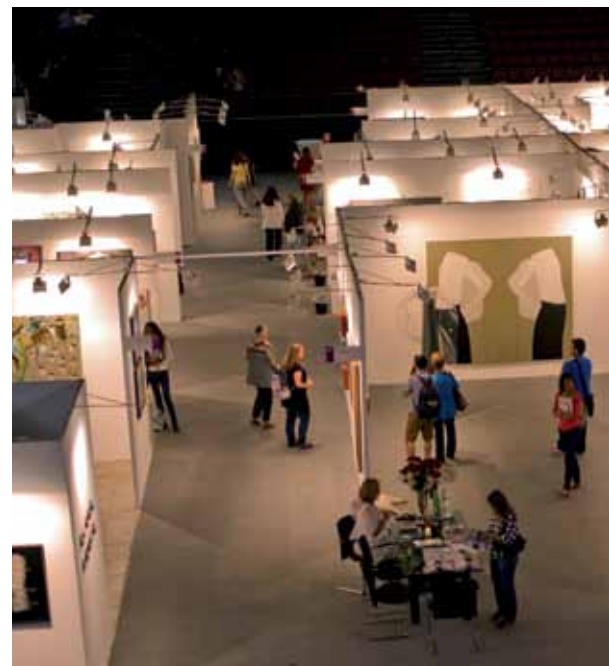
Art Athina Exhibition